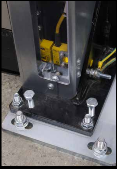
Integrated safety limit switch