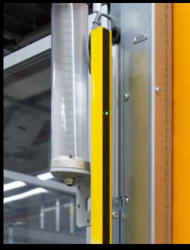
Head-safe option with safety light grid

In addition, our machine protection doors can be supplemented with the head-safe option. Here, the operator's side is equipped with a safety light grid that prevents the door from closing as soon as an obstacle is detected.