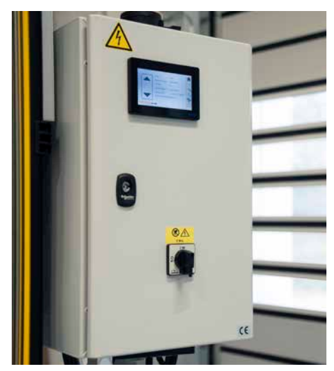
Control box EFA-ProfiNetSafe®