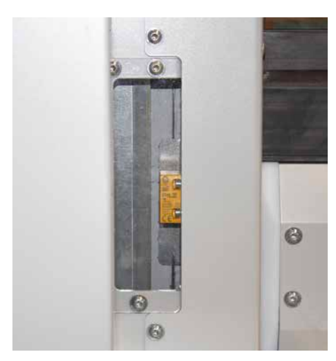
Integrated safety limit switch